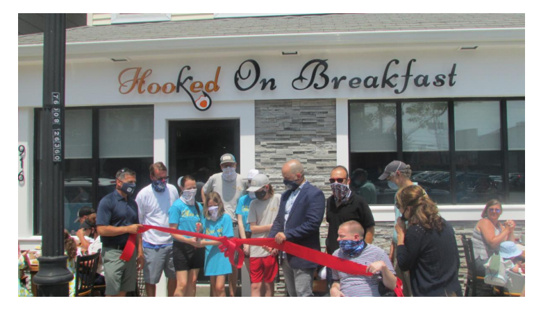
Hooked on Breakfast Ribbon Cutting Cereomony 916 Asbury Avenue