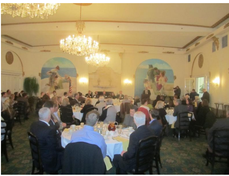
Congressman Frank LoBiondo Luncheon